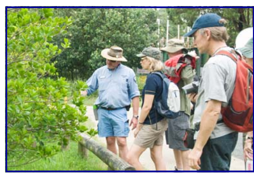
Bus Tour Group identifies a Milky Mangrove along the track near Nudgee Beach

Queensland Rail wants to reduce its impact on the local environment and is presently encouraging local environmental groups (including KBCB) to propose areas for some planting of trees nearby. Anything that can reduce the harshness of bare concrete, bitumen and steel on the eye, and wildlife, would be appreciated. (Charles Ivin)