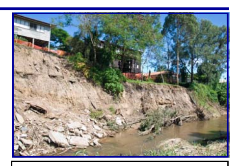
Properties threatened by land slip at McConaghy St., Mitchelton

The Wetlands Water Treatment Facility at