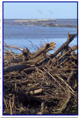
Kedron Brook into Moreton Bay with sections of a floating walkway out in the bay (Robert Standish-White)

stemming from widespread change of land use. Urban catchments such as our own have become significantly harder, with hectares of tin and tarmac chucking water into the creek at far accelerated rates, reducing permeation and increasing channel damage. We need to lobby for more sympathetic civil and urban design, so we can treat storm events as