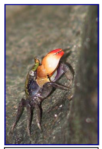
Red-fingered Marsh Crab (Robert Standish-White)

(State of the Brook continued from page 2)