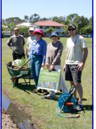
Melrose Creek Bushcare Group are a happy crew with habitat management

Myrtle Rust is distinctive in that it produces masses of powdery bright yellow or orange-yellow spores on infected plant parts. It infects leaves of susceptible plants