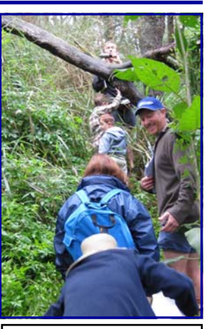
"Walking the track" at Kalinga Park (E Maltby)

This slope has presented considerable challenges due to its gradient and also the large amount of solid fill underneath the surface soil (fridges, genera-