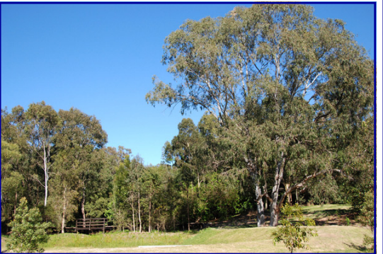
Magnificant Grange Forest Park

Our next branch meeting will include an update from the other major work in progress, the Gateway Duplication. It won't be long before a six-lane highway flies over the water in the wetlands, and we shall hear what strategies are being used to ameliorate environmental impacts of such a huge intrusion. It may strike some of us as ironic that just as we notice climate change begin to affect us with shifting weather patterns we are spending hugely on infrastructure to support one of the major culprits in greenhouse gas