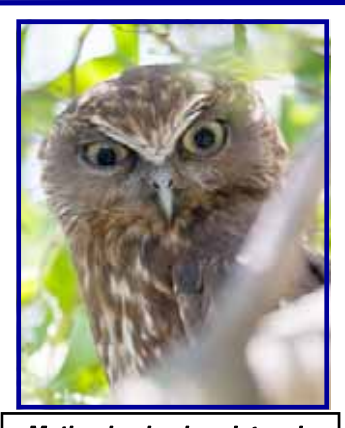
Mother boobook owl guards her offspring at Grinstead Park

possibility of conducting some surveys of bird life along the Brook, spaced over next year so that the effects of season and migration habits can be accommodated. Survey techniques would be based upon those of Birds Queensland and their qualified support would assist our own volunteers. (DD)