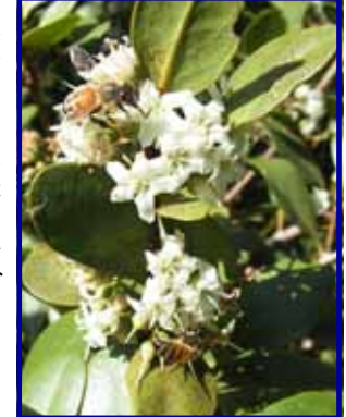
Mangroves flowering near Toombul Shopping Centre

I think the size of the swing should indicate that while people obviously would like to retain economic prosperity, there is deep concern about the other two bottom lines. We cannot wait for the promise of possible new technologies and for others to do what