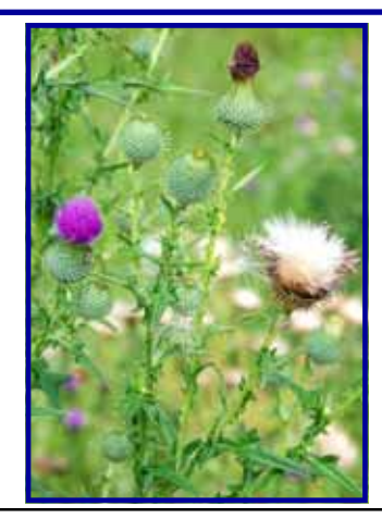
Spear Thistle (Cirsium vulgare)

This well known weed is a biennial plant, and grows to 1.5 m with spiny green leaves that are white-furry on the underside. The flower heads are also spiny, with a tuft of purple florets.