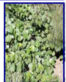
Ruellia and Syngonium Vine at the Les Atkinson Park Field Tour