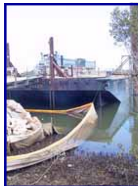
Barge bridge over Brook near Nudgee (R Standish-White)

Works are now in hand all along the extent of this almost 2 billion dollar undertaking, with fill material being