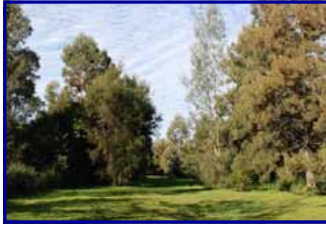
Rejuvenated area In Les Atkinson Park