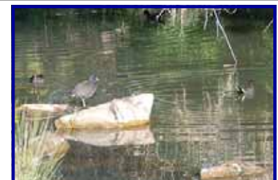
Dusky Morehens, not immediately threatened, at Teralba Park