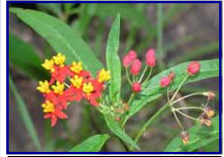
Red cotton bush (Asclepias curassavica)